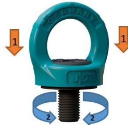
Fig. 5: Mounting and dismounting the ring point

The screw is locked in the housing by pressing the housing (1) and a slight twisting movement (max. 90°). In the depressed condition the screw can be tightened without tools (2) until it is flush with the support surface. The ring point is then tightened hand-tight; a separate tool is not necessary. Subsequently the rotatability of the housing must be checked.