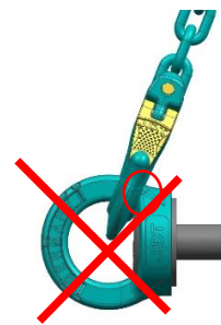
Fig. 4: A load of >90^\circ is not allowed if the hooked-in attachment device is supported on the load or on the ring point body.