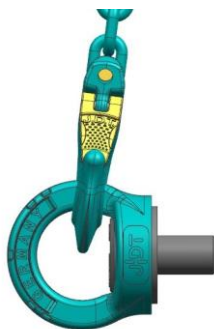
Fig. 3: A load of >90^\circ is permissible if the hooked-in attachment device is neither supported on the load nor on the ring point body.